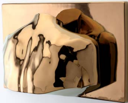
Full "tergo", bronze colour finish