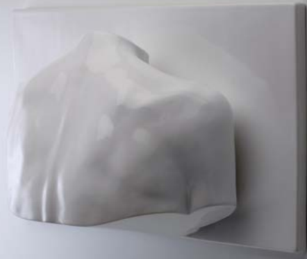
Full "tergo" (back), white finish