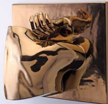
Half "tergo" with hand, bronze colour finish

"Full" model measurement: 55 cm x H32 cm "Half" model measurement: 40 cm x H 32 cm