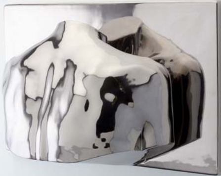
Full "tergo", platinum colour finish