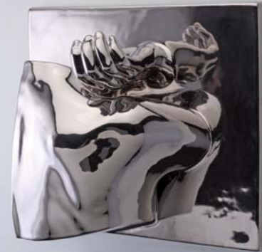
Half "tergo" with hand, platinum colour