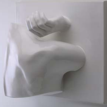
Half "tergo" with hand, white finish